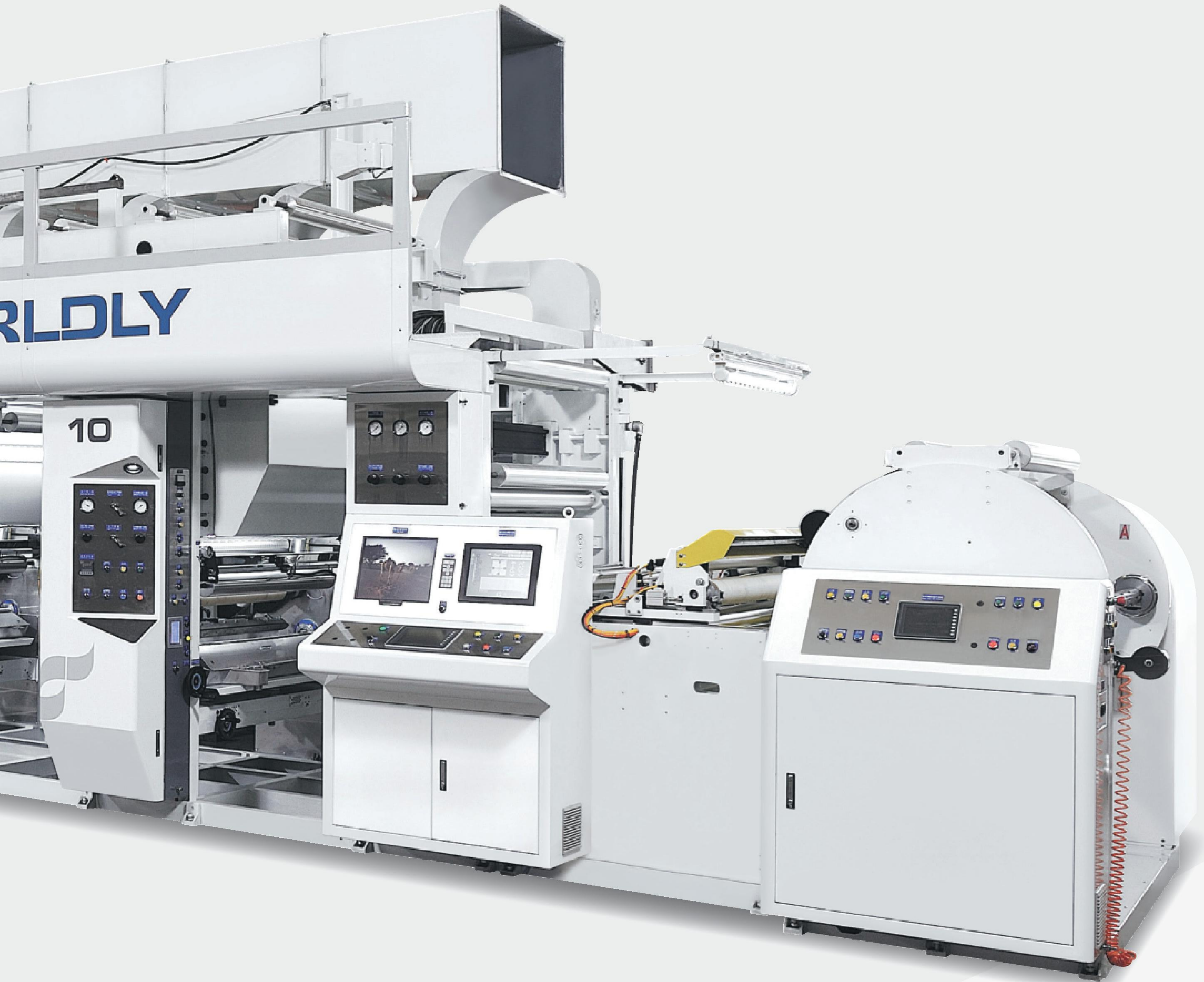
Shafted or shaftless duplex turret winders with automatic splicer